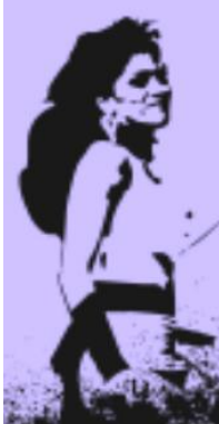
SHEILA E GRAMMY AWARD NOMINEE