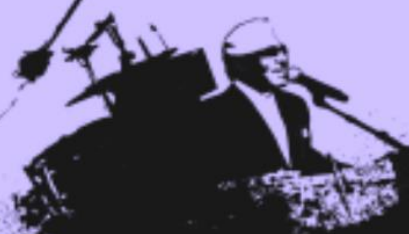
PETE ESCOVEDO 3X GRAMMY AWARD WINNER