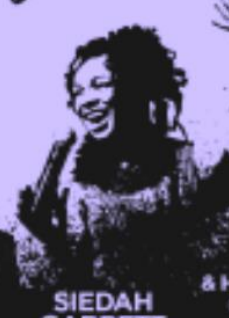
SIEDAH GARRETT LAUSD ALUMNI, GRAMMY AWARD WINNER