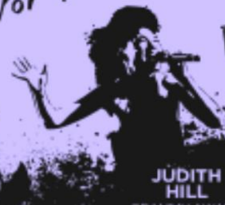
JUDITH HILL GRAMMY AWARD WINNER